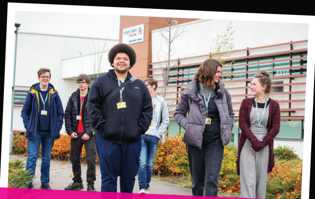
Hugh Baird College number one further education college for A-level performance in the Liverpool City Region