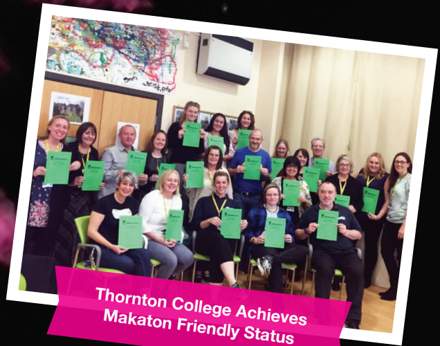
Thornton College Achieves Makaton Friendly Status