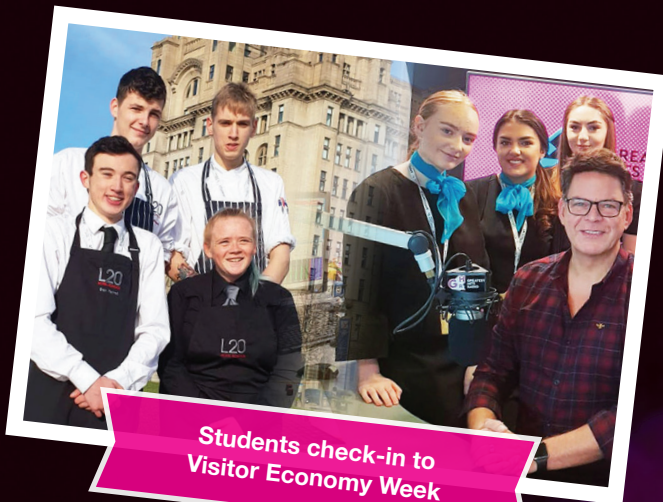
Students check-in to Visitor Economy Week