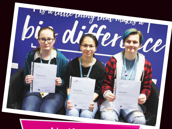
A-level Students Win Gold Crest Awards