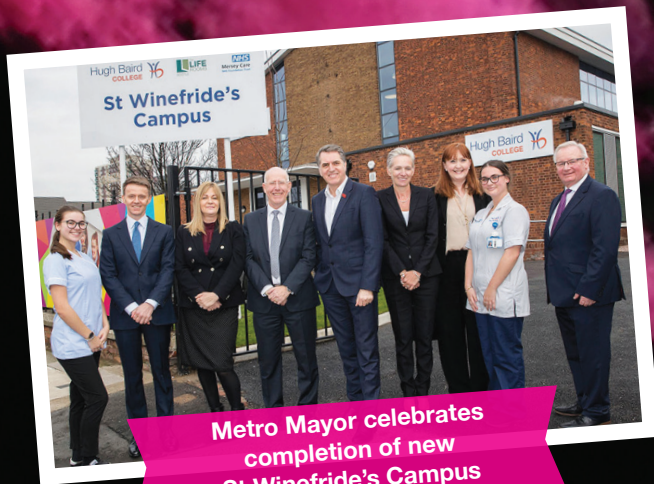
Metro Mayor celebrates completion of new St Winefride's Campus