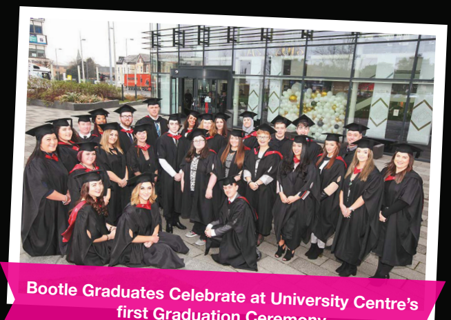
Bootle Graduates Celebrate at University Centre's first Graduation Ceremony