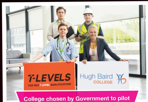
College chosen by Government to pilot revolutionary new T Level qualifications