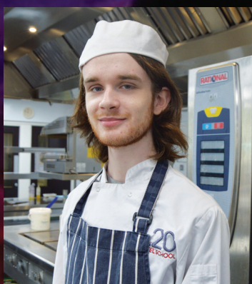
Kane Ward Award for Excellence in Work Placement