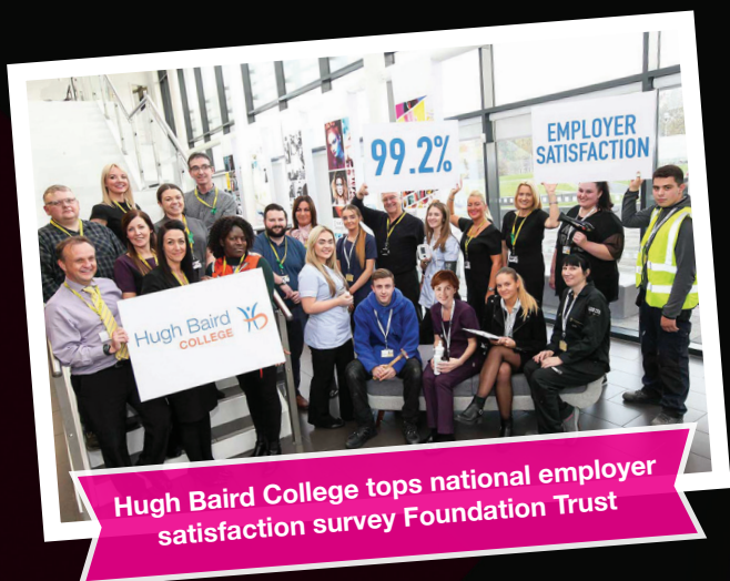
Hugh Baird College tops national employer satisfaction survey Foundation Trust